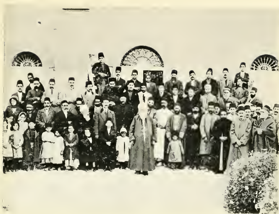
ABDUL BAHÁ AND A GROUP OF BELIEVERS AT THE TOMB OF THE Báb